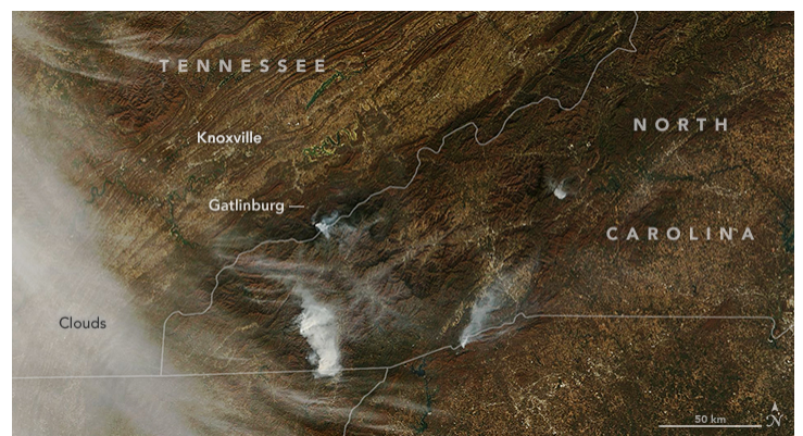
NASA MODIS satellite imagery of wildfire smoke taken on November 27, 2016.

Streamflow is one of the earliest indicators of drying conditions. US Geological Survey streamflow gages show surface water levels well below normal across the Carolinas. During fall 2016, conservation measures were implemented in the areas most impacted with multiple NC public water systems requesting that customers conserve water or issuing mandatory water use restrictions. Lakes in the Duke Energy Catawba-Wateree reservoir system are currently in Stage 1 Drought. On its lake levels information page, Duke Energy asks customers to be mindful of water use and to conserve energy to save water used in hydroelectric power generation. Residents who water their lawns with lake water are asked to limit watering to Tuesdays and Saturdays. Groundwater levels are also depleted in some locations, especially where there are shallow wells.